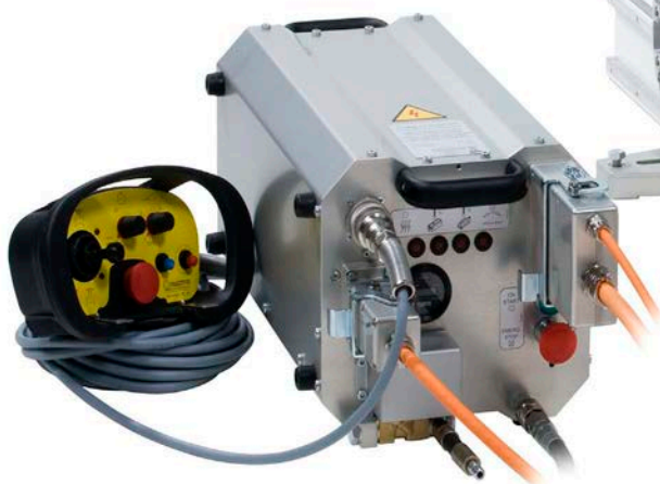
Pentpak 427 HF-power pack with Pentruder autofeed system