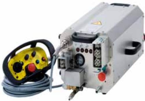
Pentpak 418 HF-power pack with Pentruder autofeed system