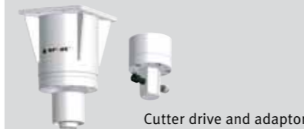
Cutter drive and adaptor