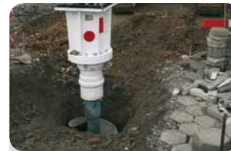
+ Conversion to an ADU auger drive unit possible