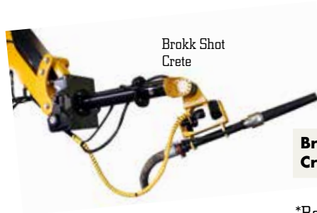
Brokk Shot Crete

*Requires load holding valves with hose burst function Requires two extra hydraulic functions