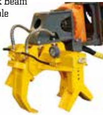
Brokk Beam Grapple